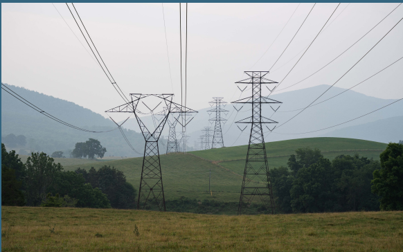
Natina lattice towers effortlessly blend into Virginia's landscape.

Natina is a committed eco-friendly color solutions manufacturer