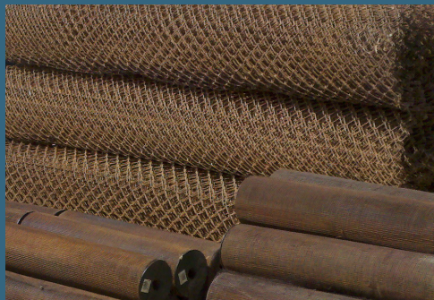
Natina chain-link and wildlife fencing before installation

Everyone involved in this project were pleased, as the fencing not only enhanced the surrounding area but also provided essential protection for the animals from the nearby highway.