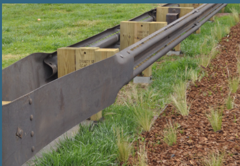
Natina Steel Solution applied in 2012.

Connect with us to learn how we can transform your project.