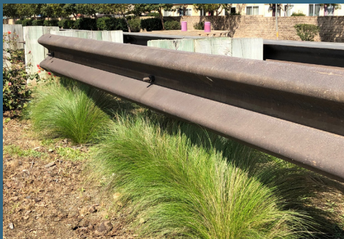
Natina Steel Solution shown in 2019.

Materials applied with Natina: Guardrail and all components